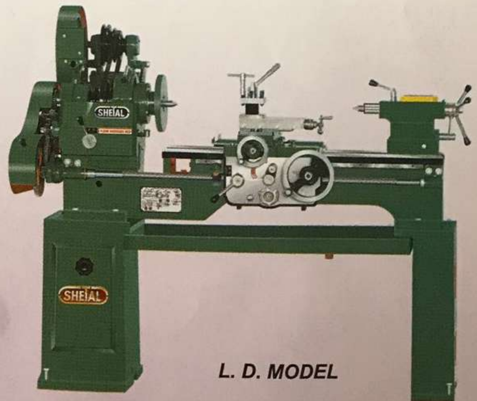
L. D. MODEL