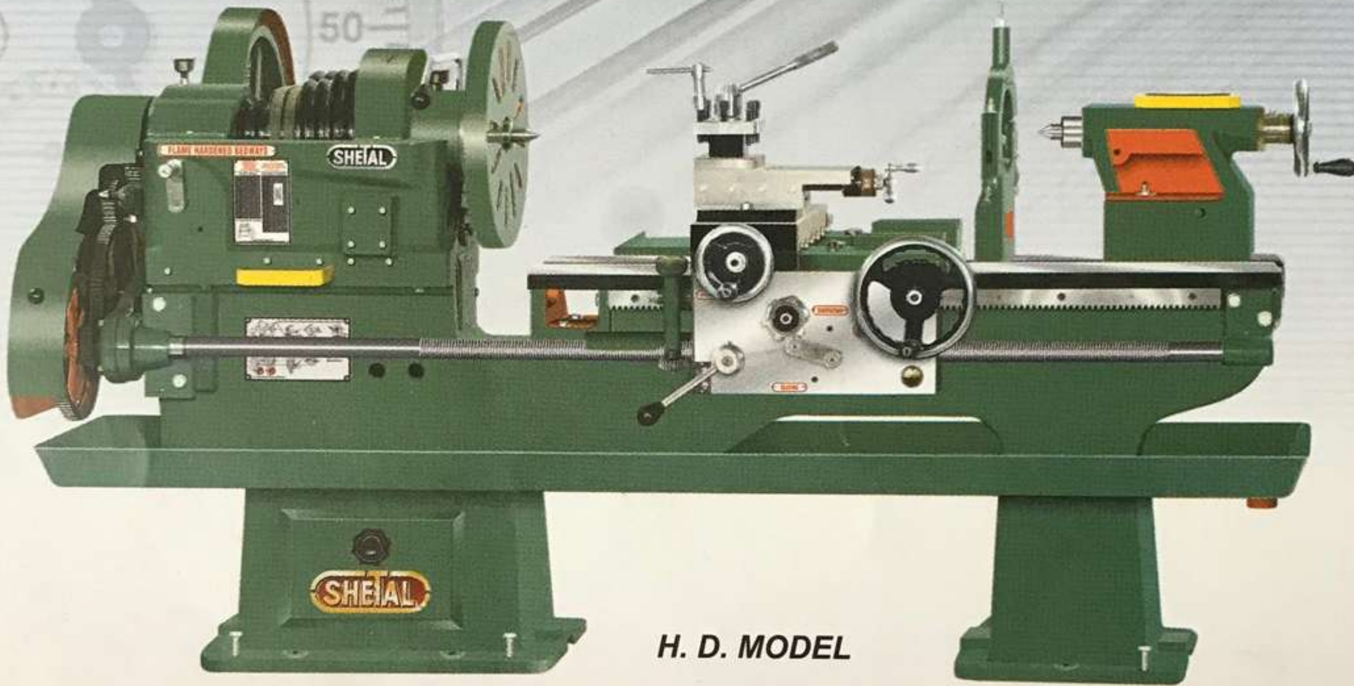
H. D. MODEL

HEAVY, MEDIUM AND LIGHT DUTY LATHE MACHINES